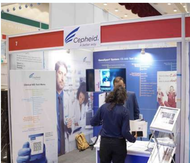
1X Regular Stall