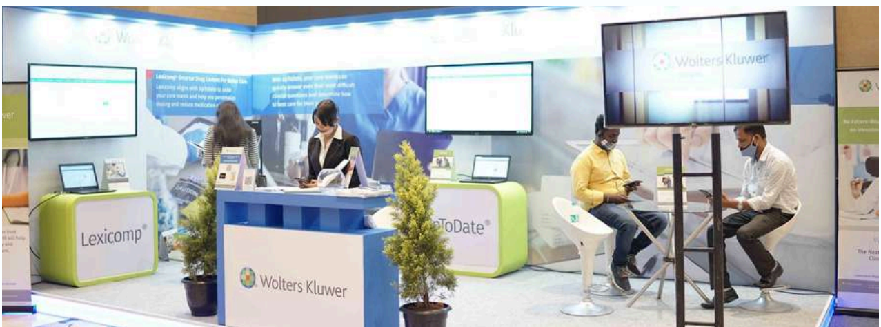
2X Premium Stalls